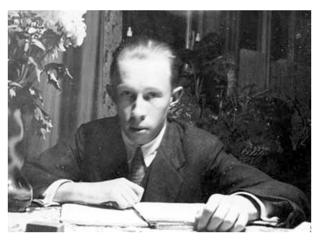
Über den Begriff der "Pseudogruppe von Transformationen" (1939).