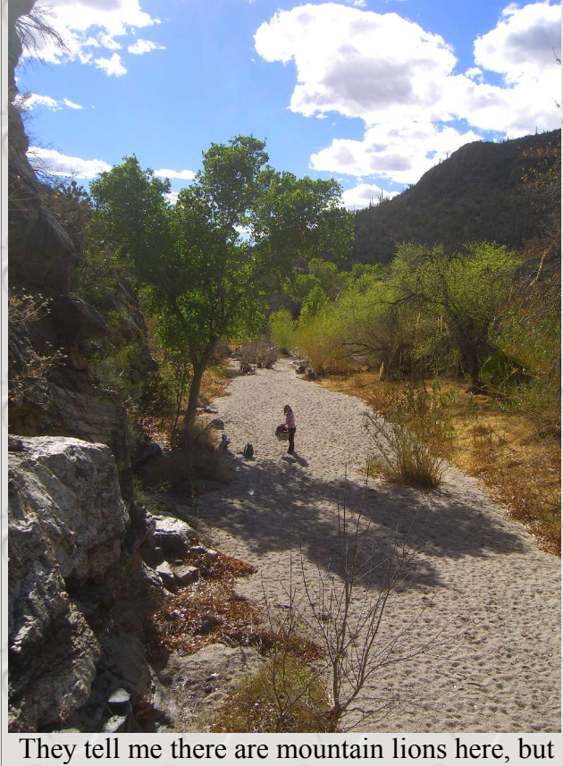
They tell me there are mountain lions here, but I've been waiting hours...