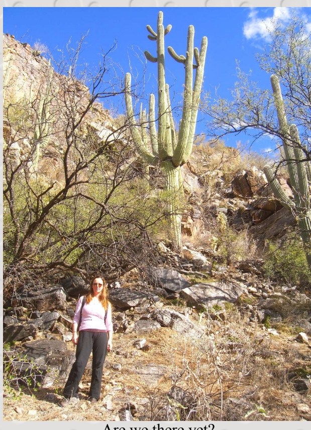
Are we there yet?