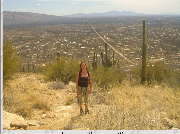
Are we there yet?