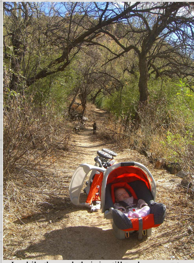
Luckily the pushchair is still under guarantee.