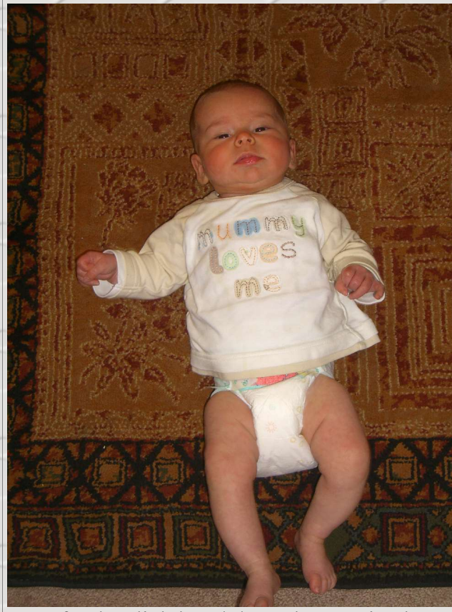
Out of order slightly: 2/4/06 - she's getting longer