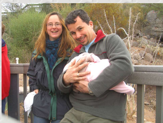
Biosphere2 (before being told off for giggling)