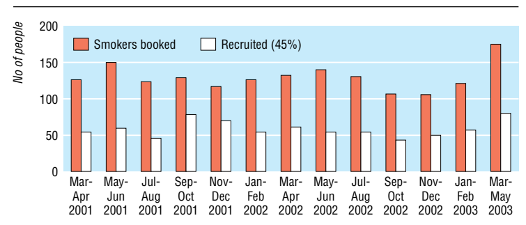
Fig 1 Enrolment of women over time

ing (change already)). A third party made up envelopes in batches. Intervention and control groups were similar at baseline (table 1). Participants and midwives were aware of group assignment.