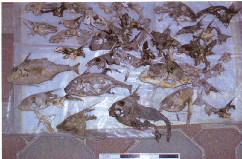
Plate 2 View of tripodfish fish remains collected from beneath the osprey feeding post on Marawah

In contrast to the fish remains described above, archaeological excavations carried out in 1999 by the Abu Dhabi Islands Archaeological Survey (ADIAS) of a number of cairn sites, described as MR6, located on the north-western shore of Marawah have recovered fish bone remains which are likely to have been associated with former osprey sites (Beech 2001). The abandoned mounds of former tombs and kilns may have provided ideal perching points for ospreys hunting on the northern side of the island. The fish bone assemblages associated with these sites are somewhat different, however, to the modern assemblage described here from the southern side of the island. Fishes represented within them are predominantly composed of small parrotfishes (Scaridae)