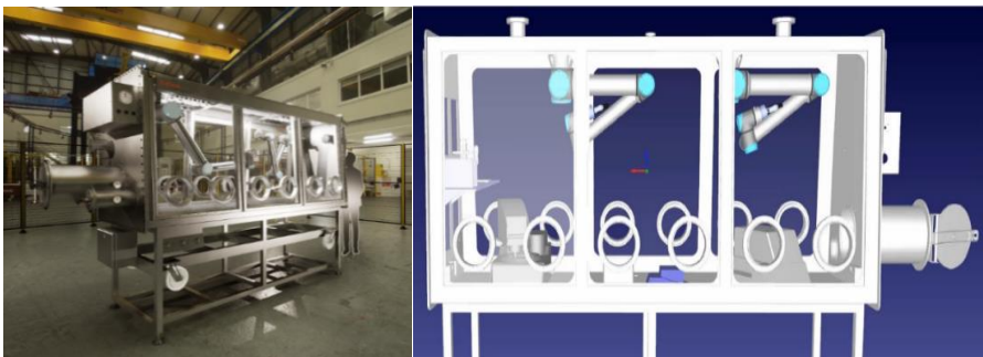
Fig 1. CAD Renders of the RAICo Strawman Glovebox

For the purposes of the strawman glovebox, this AI layer would be theoretically applied to an existing hardware project built to test remote sample processing using a modified glovebox fitted with two collaborative robot arms (Figure 2). This was done intentionally to reflect a generic glovebox in industry and ensure that this could serve as a base for the implementation of an autonomous system in the context of SACE.