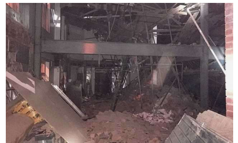
Examine and analyze buildings, infrastructure and environments.